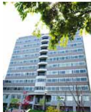
New Humanities Building